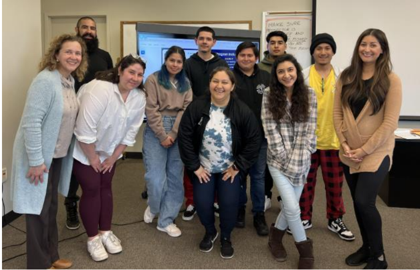
Womxn of Color Collaborative Social